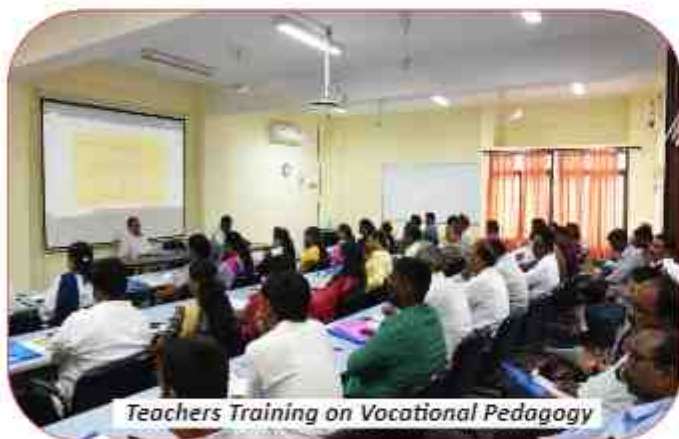
Teachers Training on Vocational Pedagogy