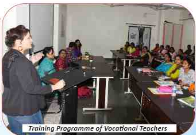
Training Programme of Vocational Teachers