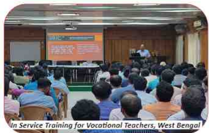
In Service Training for Vocational Teachers, West Bengal