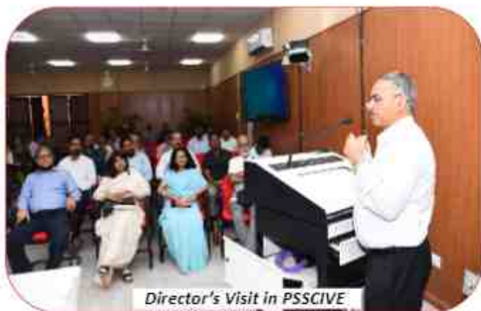
Director's Visit in PSSCIVE