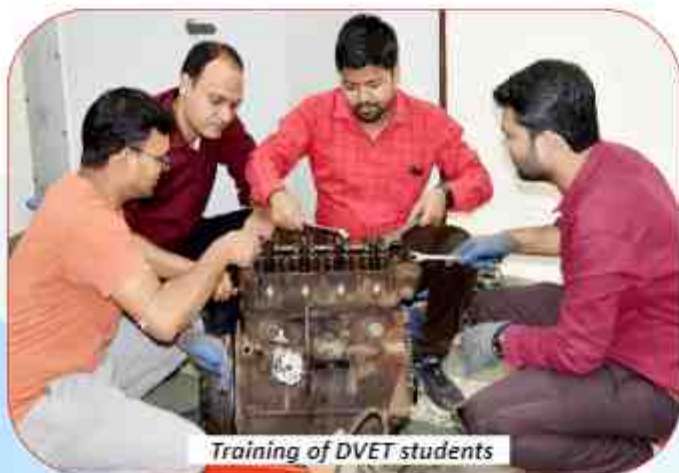
Training of DVET students