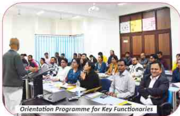
Orientation Programme for Key Functionaries