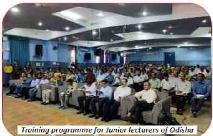
Training programme for Junior lecturers of Odisha