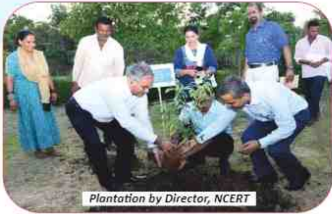
Plantation by Director, NCERT