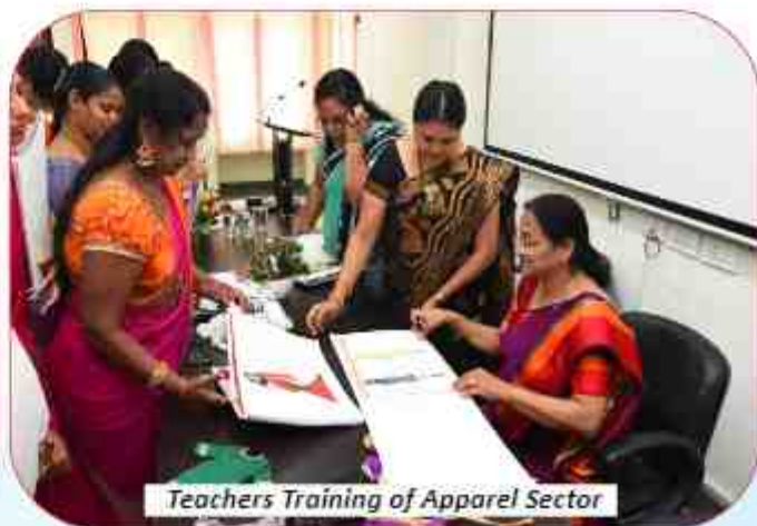
Teachers Training of Apparel Sector