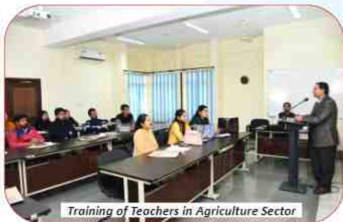
Training of Teachers in Agriculture Sector