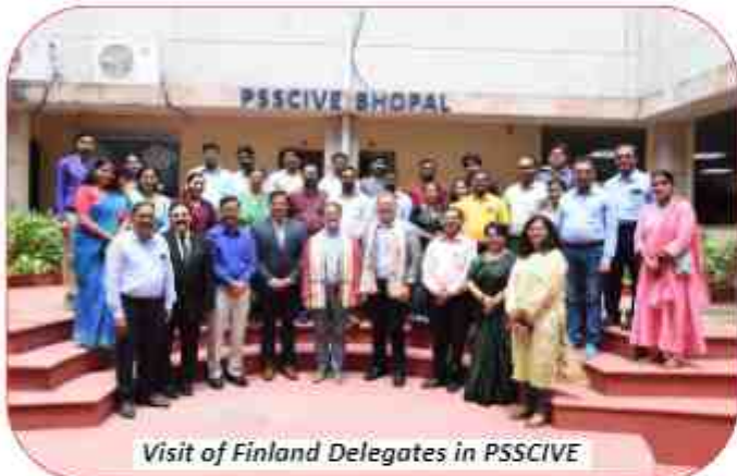
Visit of Finland Delegates in PSSCIVE